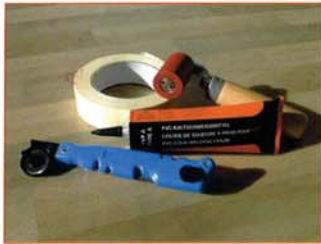
Much success with only a few tools!

The 3 Steps for a successfully sealed seam in PVC-floor coverings