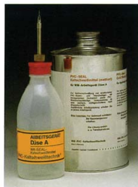
PVC Cold Welding Set consisting of:

1 litre is sufficient to seal approx. 150 metres of seam.