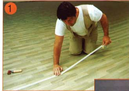
Place special masking tape centered over the closely-cut seam and press on tightly with a roll.