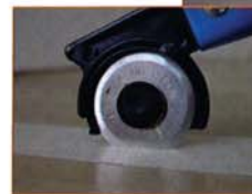
Cut masking tape easily with the rolling knife in the area of the seam. With hard coverings (e.g. object floorings) the seam area has to be heated to a maximum of 40 °C directly before welding, by using an iron or a heat gun.